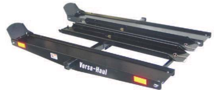
Assembled VH-90 carrier with RK