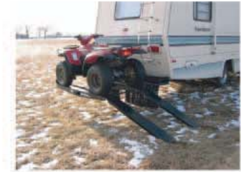
VH-90RO in use.