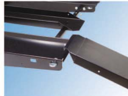
Attaching the Ramp.